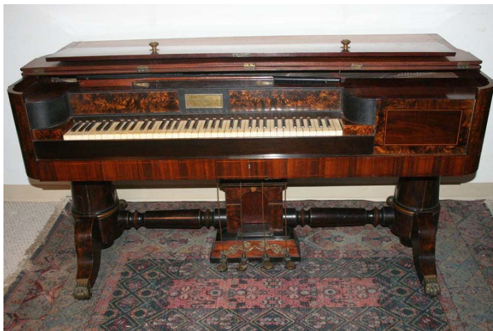
Square piano circa 1832 by A. Reuss, Walnut St. Cincinnati, collection of the author

He has moved from No. 130 Main near the Ohio River to the east side of Walnut Street between 4 th and 5 th street, a prestigious location. He is clearly marketing to wealthy German families by emphasizing his connection to Vienna and imported German materials, though the wood types chosen speak more to types found in typical high end American furniture of the time.