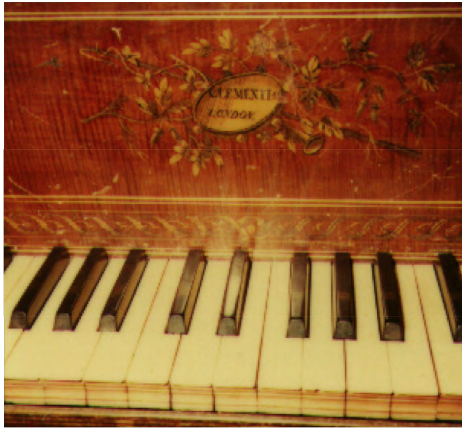
One of Clementi's earliest upright grand pianofortes, ug 30/1822, from 1801. This irregular, oval cartouche on a maplewood nameboard, is exceptional and only found on very early Clementi pianos.