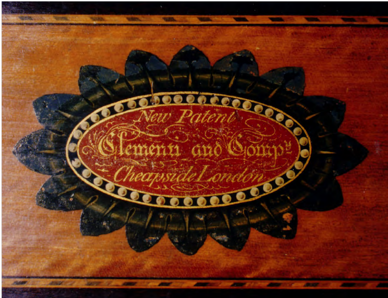
Satinwood nameboard with mahogany crossbanding and geometrical stringing. 168x59 cm. B number erased, C number (310) on the spine.