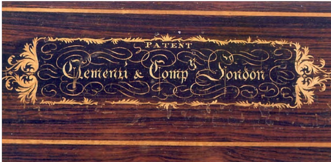
Nameboard in rosewood and brass inlays.