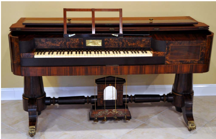
Square piano circa 1834/35 10 by A. Reuss, Walnut St. Cincinnati, collection of the author

He was clearly marketing to wealthy German families by emphasizing his connection to Vienna and imported German materials, though the wood types chosen speak more to types found in typical high end American furniture of the time.