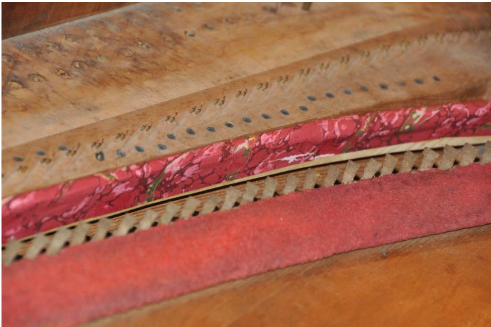
Bassoon (marbled paper loop on wooden batten)and moderator tabs