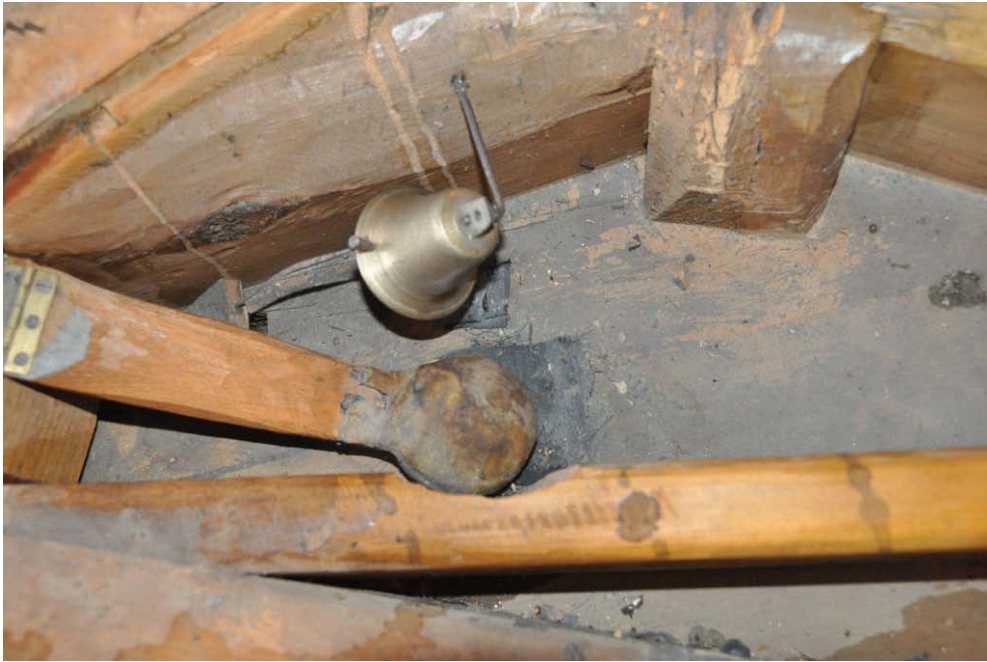
Drum beater and bell for Janissary

The piano is triple strung in the treble and tenor, and double strung in the lower bass, without any over spun bass strings, in keeping with the Austrian piano building tradition. The light weight hammers give an easy response, and the action touch is shallow compared to English and American built, English tradition pianos of the time. Two additional pedals produce a drum and bell ring, know as Jannisarry stops, and a bassoon stop in the bass and tenor, popular in the late 1820s to mid 1830s Viennese pianos.